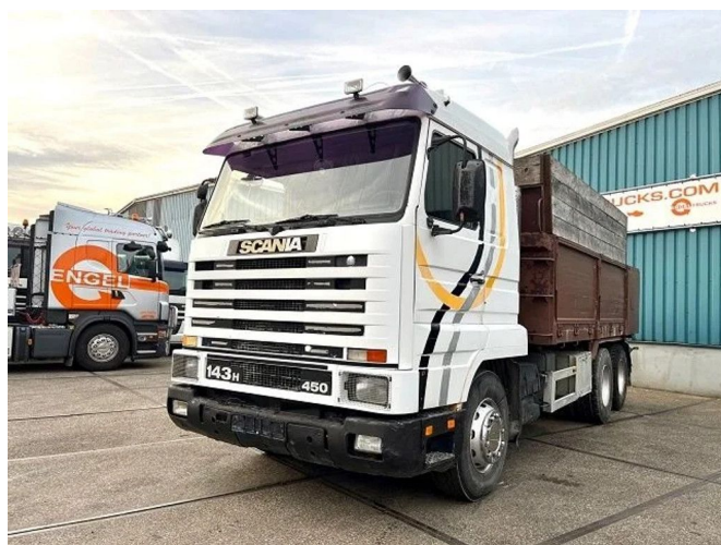
Scania R143-450 V8 STREAMLINE 6x2 FULL STEEL KIPPE...