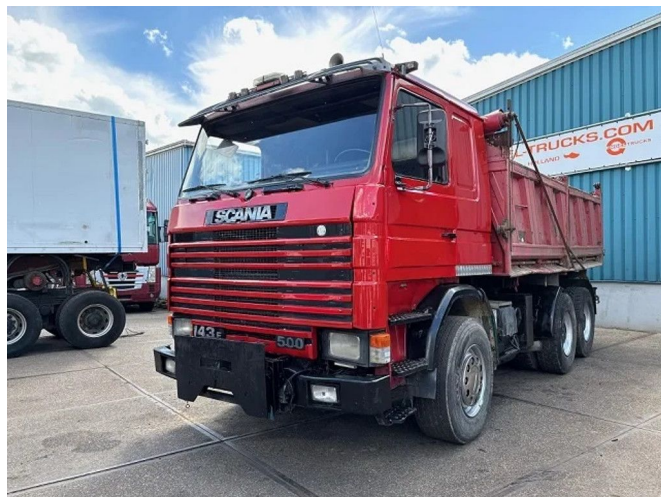
Scania R143-420 V8 6x4 FULL STEEL MEILLER KIPPER (M...