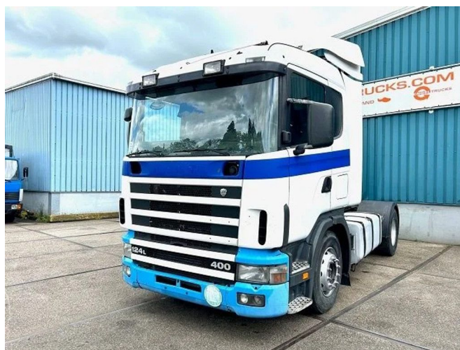
Scania R124-400 L 4x2 SLEEPERCAB ADR/VLG (2 FUEL LI...