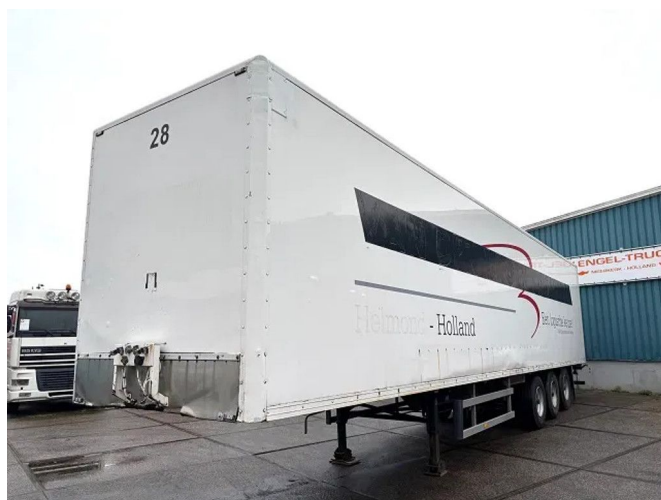
Pacton / JUMBO 3-AXLE CLOSED BOX WITH FULL STEEL ...