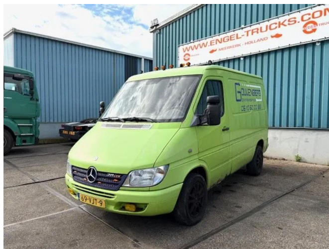
Mercedes-Benz Sprinter 311 CDI CLOSED VAN (MANUAL ...

• 5 Gears manual gearbox • Anti-lock braking system • Anti-lock braking system • Closed cabin • Partition without window • Power steering • Radio/CD player • Third brake light • Towbar • Two rear doors