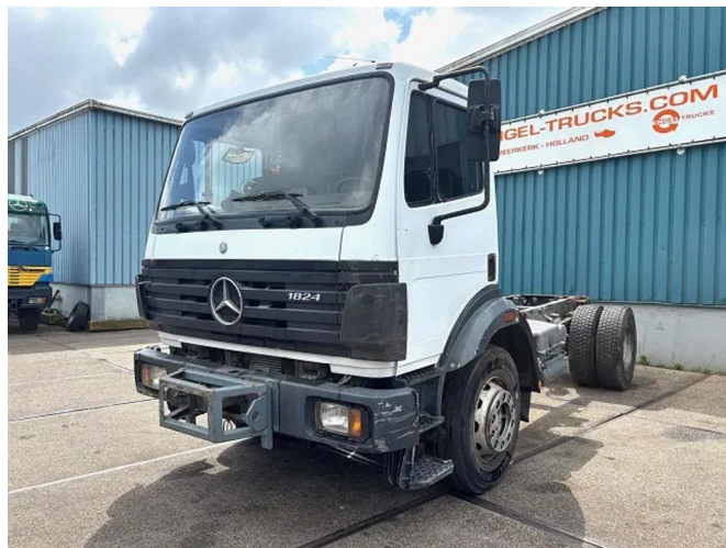
Mercedes-Benz SK 1824 4x2 FULL STEEL SUSPENSION C...