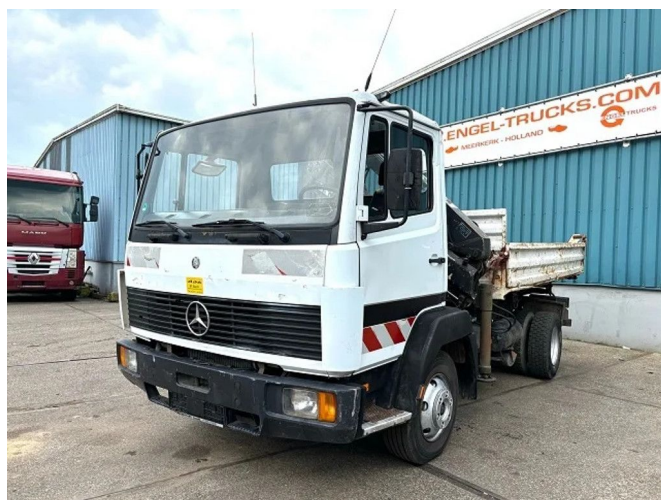
Mercedes-Benz LK 817K (6-CILINDER) FULL STEEL M... 4x2