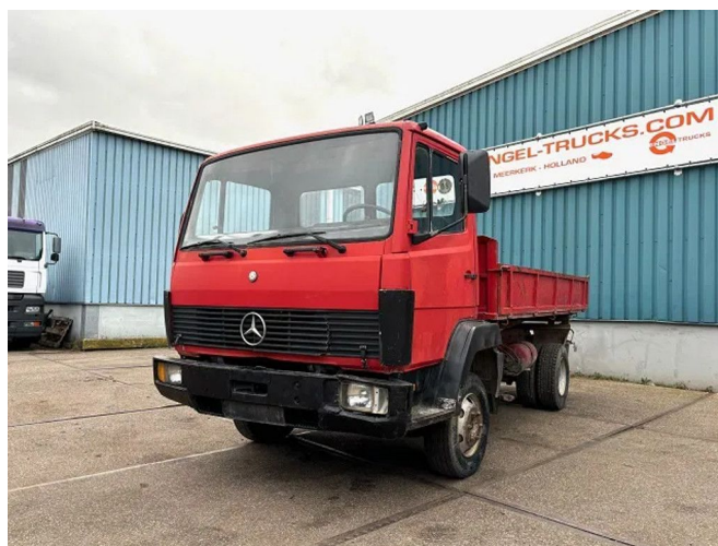
Mercedes-Benz LK 814 K 4x2 (6-CILINDER) KIPPER (MANU...