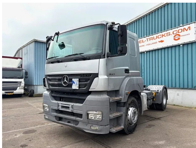
Mercedes-Benz Axor 1843 LS SLEEPERCAB (MANUAL... 4x2