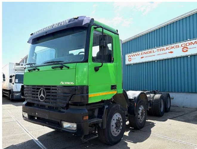
Mercedes-Benz Actros 4140 K 8x4 FULL STEEL CHASSIS (...)