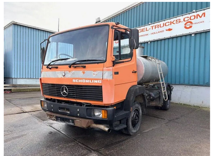
Mercedes-Benz 914 KO RHD 4x2 FULL STEEL TANK TRUCK... Referentienummer: SN 57816153