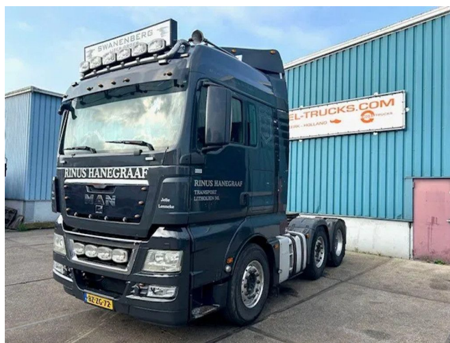
MAN TGX 26.480BLS XLX 6x2 (ZF16 MANUAL GEARBOX / ...