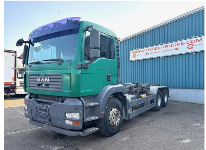
MAN TGA 26.360BB 6x4 FULL STEEL MULTILIFT HOOK-A...