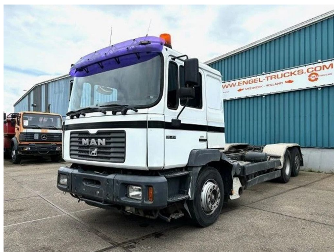
MAN 26.414 FNL-T (6-CILINDERHEADS) 6x4 CHASSIS (EU...