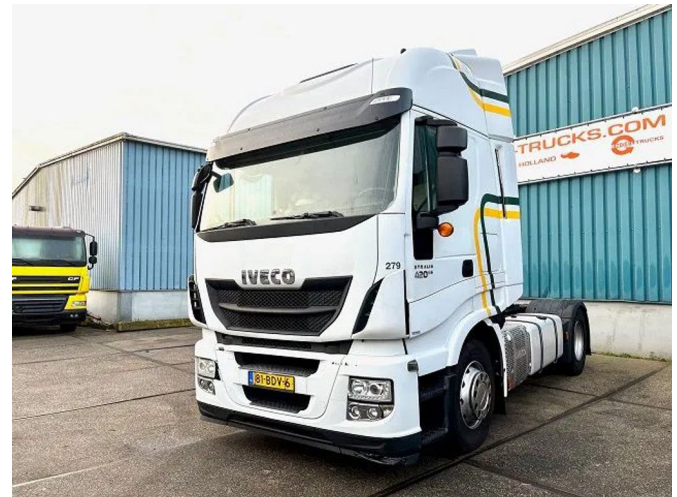
Iveco Stralis AS440S42T/P HI-WAY DUTCH TRUCK (A... 4x2 Referentienummer: SN 54222611