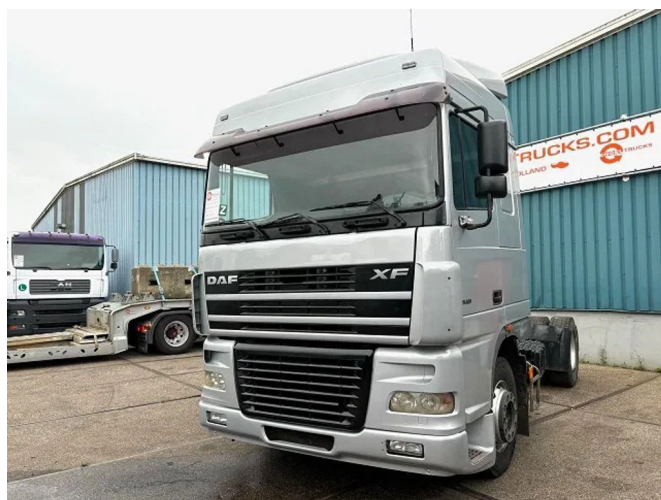
DAF XF 95.430 SPACECAB 4x2 (EURO 4 / ZF16 MANUAL ...