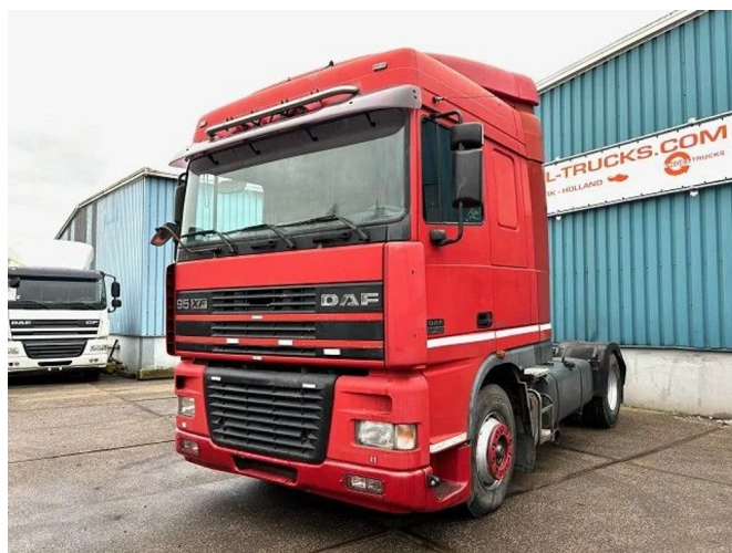
DAF 95.480 XF SPACECAB (EURO 3 / ZF16 MANUAL ... 4x2