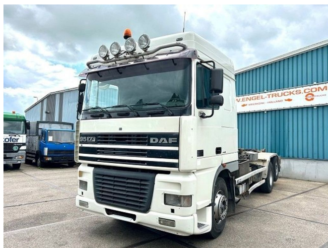
DAF 95.480 XF SPACECAB 6x2 WITH HOOK-ARM SYSTEM...