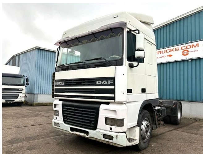
DAF 95.380 XF SPACECAB (EURO 2 (MECHANICAL ... 4x2 Referentienummer: SN 56068266 Z