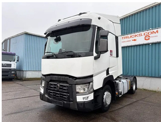
Renault T460 HIGH ROOF 4x2 (EURO 6 / AUTOMATIC GEA...