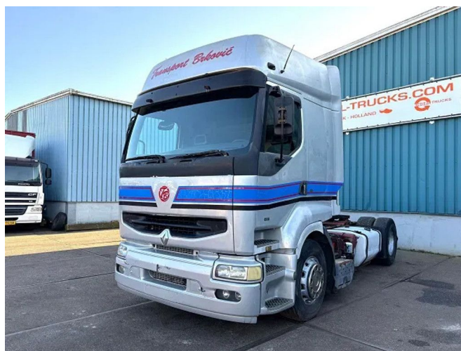
Renault Premium 400 .18T ROUTE 4x2 (POMPE MANUELLE...