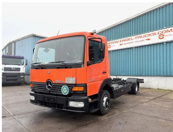
Mercedes-Benz Atego 823L DAY CAB (6-CILINDER) 4x2 CH...