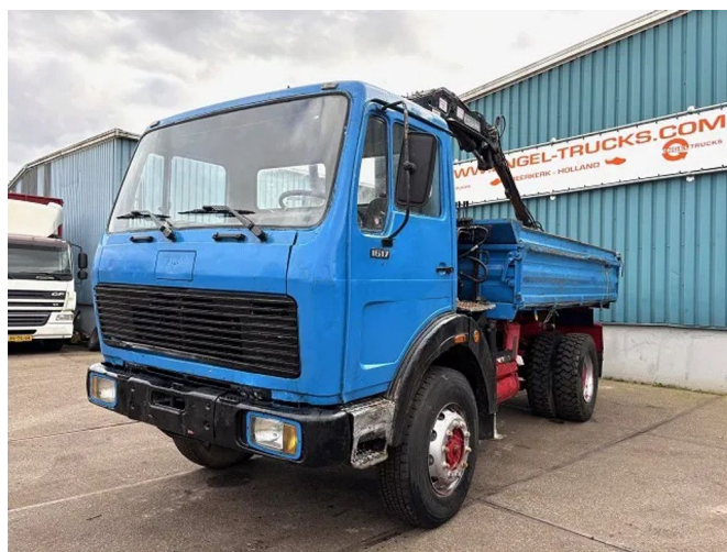
Mercedes-Benz 1617 AK 4x4 MEILLER KIPPER WITH CRA...