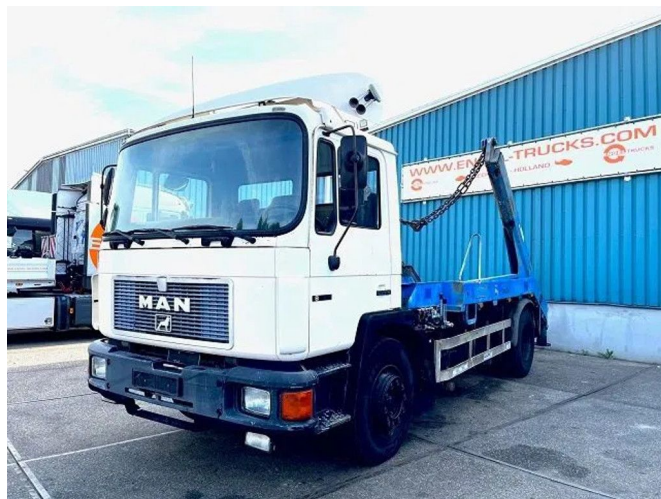
MAN 18 .232 (6 CILINDER) M90 WITH TELESCOPIC ... 4x2