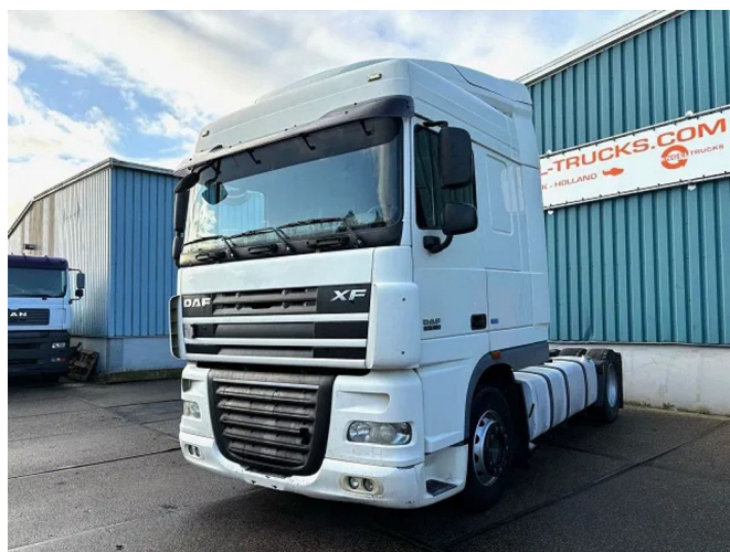
DAF XF 105.460 SPACECAB (ZF MANUAL GEARBOX / ... 4x2