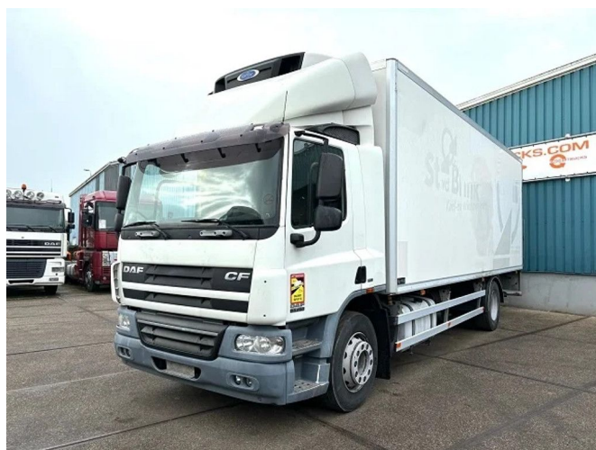
DAF CF 65.250 COOLING TRUCK WITH CARRIER D/E... 4x2