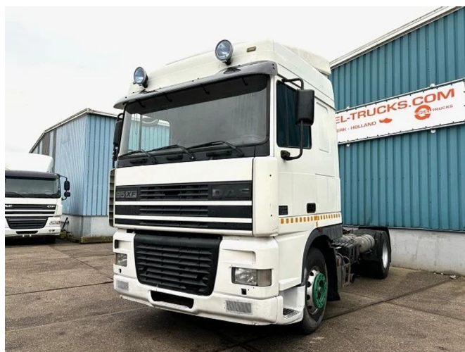
DAF 95.430 XF SPACECAB (EURO 2 / ZF16 MANUAL ... 4x2