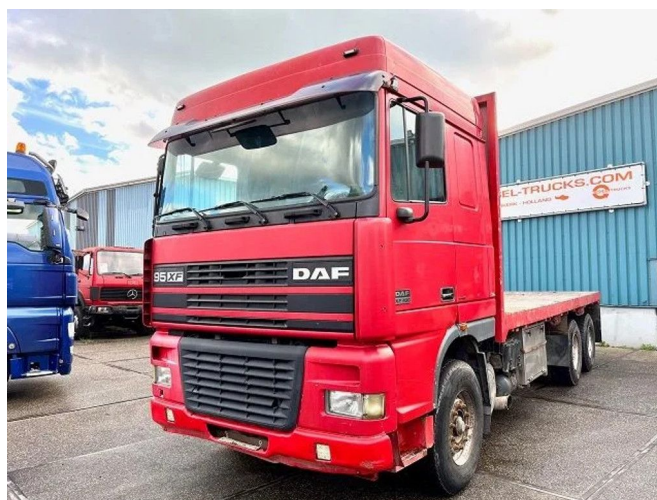
DAF 95-430XF SPACECAB 6x4 FULL STEEL WITH OPEN B...