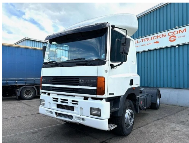
DAF 85.400 ATI SLEEPERCAB (EURO 2 / ZF16 MANU... 4x2