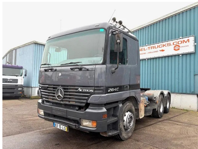
Mercedes-Benz Actros 2640 S 6x4 FULL STEEL TRACTOR ...