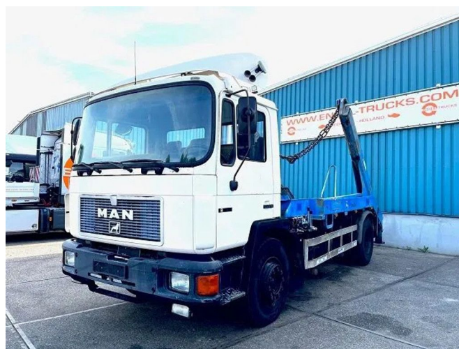
MAN 18 .232 (6 CILINDER) M90 WITH TELESCOPIC ... 4x2