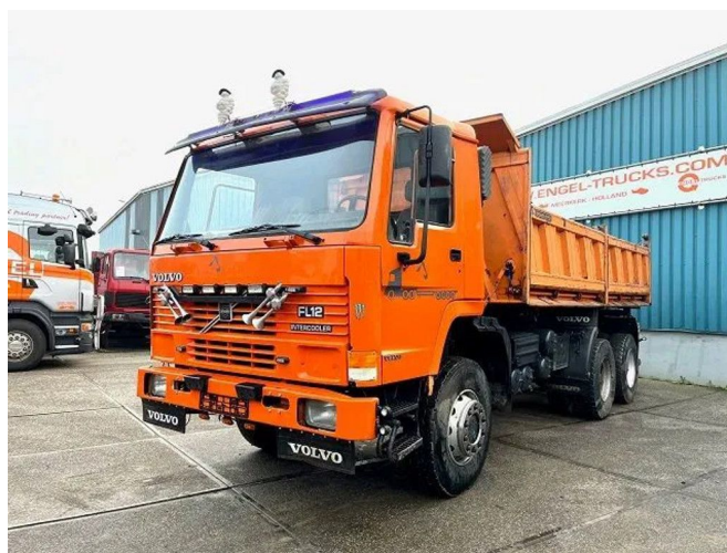
Volvo FL 12.380 6x6 FULL STEEL SUSPENSION MEILLER K... Referentienummer: SN 53819343