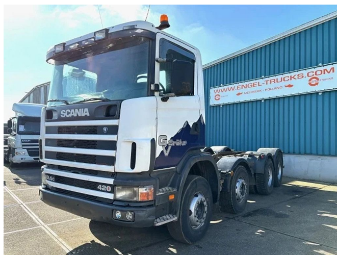
Scania R124-420 C 8x4 FULL STEEL CHASSIS (EURO 3 / F...