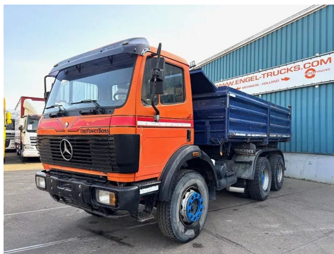
Mercedes-Benz SK 2635 V8 6x4 FULL STEEL MEILLER KIP... Referentienummer: SN 57991239 Z