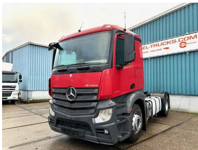
Mercedes-Benz Actros 1840 LS 4x2 SLEEPERCAB (6 IDENT... Referentienummer: SN 55962727