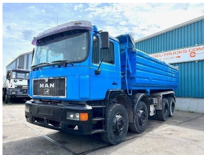
MAN 41.464 F2000 8X4 FULL STEEL KIPPER (EURO 2 / ZF... Referentienummer: SN 55149234 Z