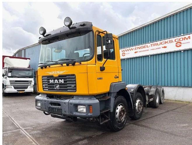
MAN 35.414 VF-TM 8x4 FULL STEEL CHASSIS (6-CILINDER... Referentienummer: SN 57820506