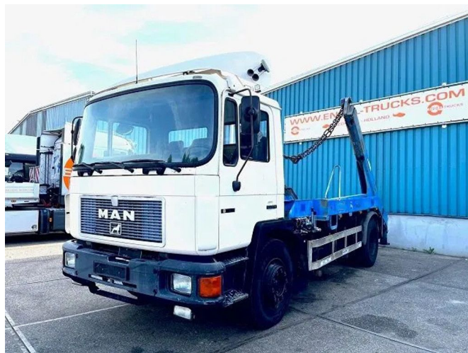
MAN 18 .232 (6 CILINDER) M90 WITH TELESCOPIC ... 4x2 Referentienummer: SN 55609062