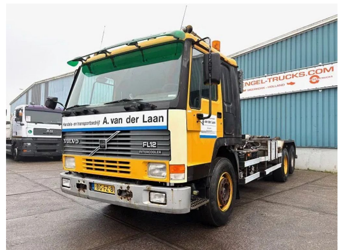
Volvo FL 12.380 6x2 A-RIDE (ORIGINAL DUTCH) HOOK-AR...