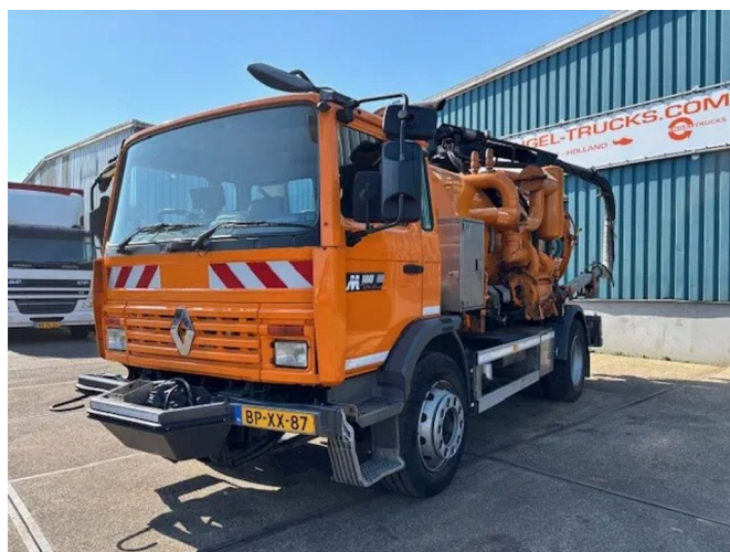
Renault Midliner 180 -15/D RHD WITH RAVO KZ7082/1... 4x2 Referenznummer: SN 58023559