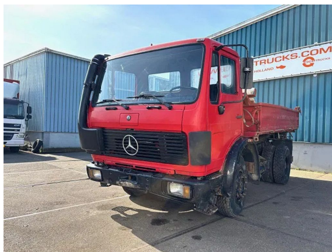
Mercedes-Benz SK 1414K 4x2 3-WAY MEILLER KIPPER (FU... Referenznummer: SN 56575945