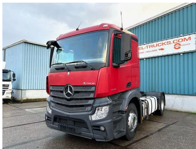
Mercedes-Benz Actros 1840 LS 4x2 SLEEPERCAB (6 IDENT... Referentienummer: SN 55945931