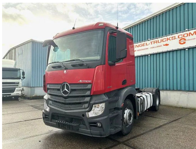
Mercedes-Benz Actros 1840 LS 4x2 SLEEPERCAB (6 IDENT...)