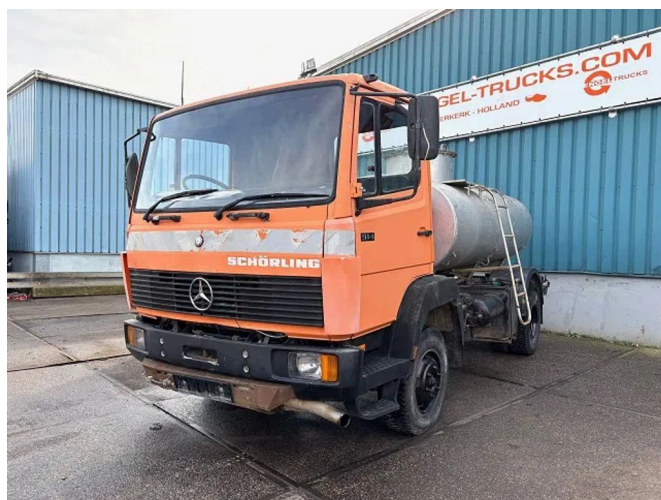
Mercedes-Benz 914 KO RHD 4x2 FULL STEEL TANK TRUCK...