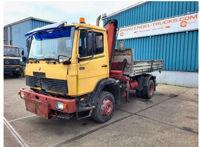
Mercedes-Benz 1117 K (6-CILINDER) KIPPER WITH F... 4x2 Referentienummer: SN 56826116