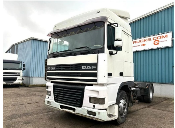
DAF 95.380 XF SPACECAB (EURO 2 (MECHANICAL ... 4x2 Referenznummer: SN 56068266 Z