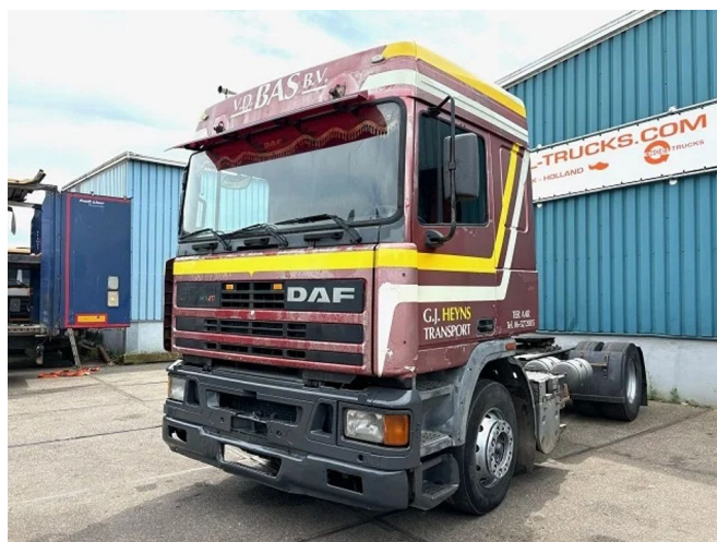
DAF 95.360 ATI SPACECAB (DUTCH TRUCK) (EURO 2... 4x2